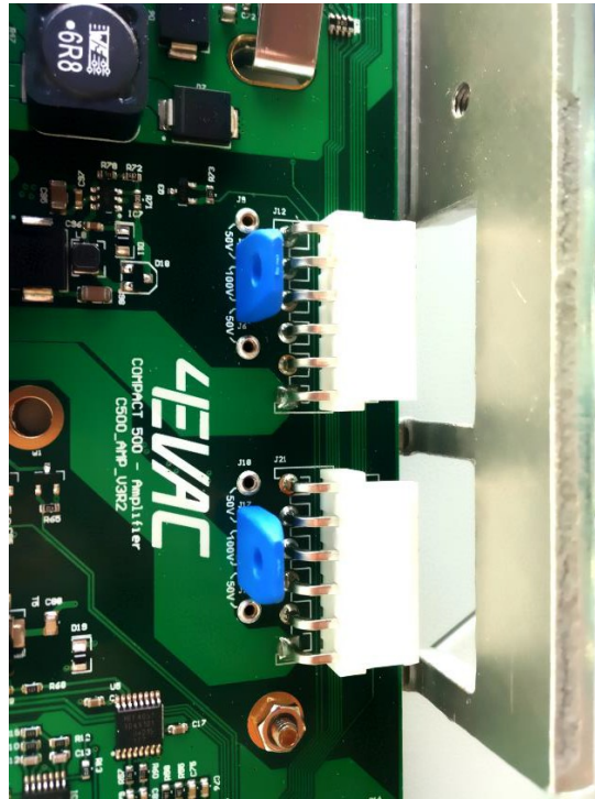
Jumper setting 100V per channel – amplifier unit

For single channel mode (2x100W), two jumpers on the amplifier unit must be plugged in the “100V” position (center position). One jumper per channel.