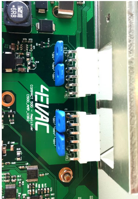
Jumper setting 50V per channel – amplifier unit

For bridged mode, (1x200W) four jumpers must be plugged in the “50V” position (left & right position). Two jumpers per channel.