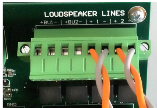
Single channel: line 1, line 2 – loudspeaker line output